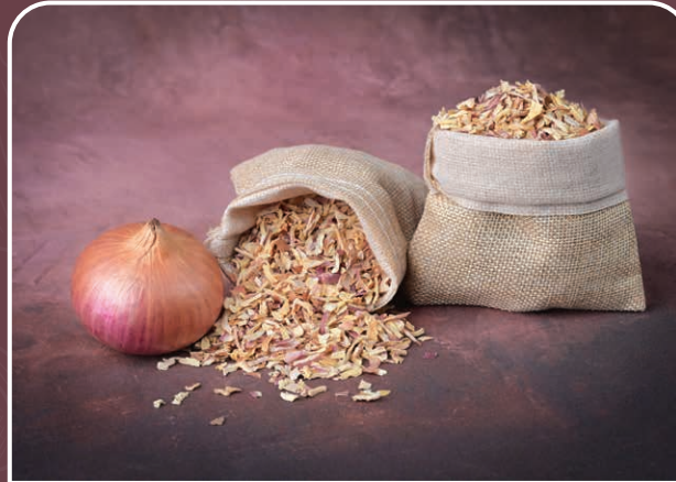
Pink Onion Chopped