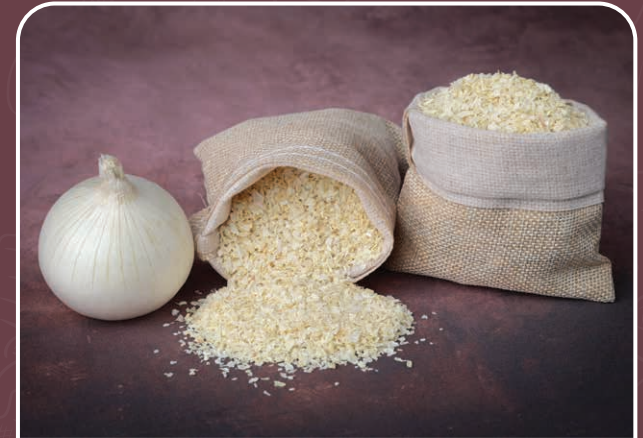
White Onion Minced 1-3 mm