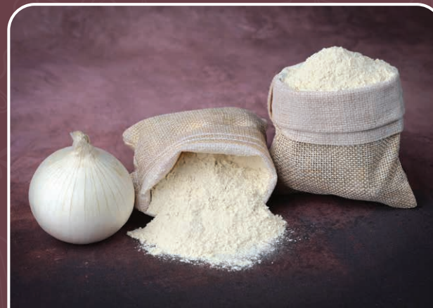
White Onion Powder