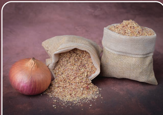
Pink Onion Granules 0.5-1 mm