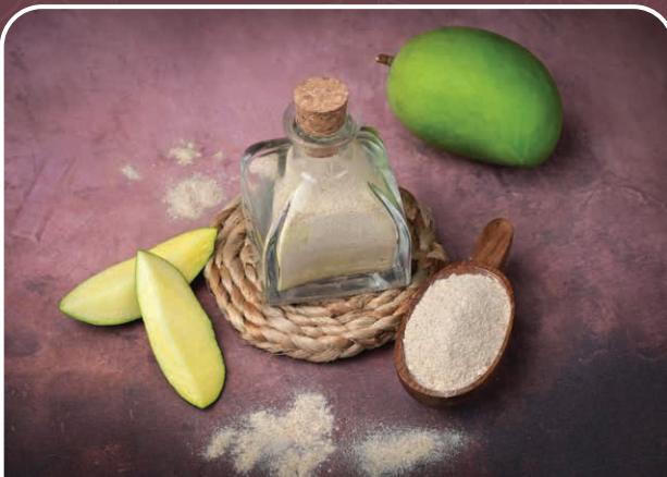
Dry Mango Powder