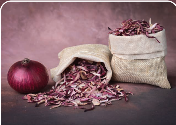
Red Onion Flakes