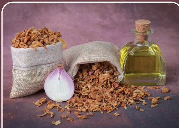
Fried Coated Pink Onion