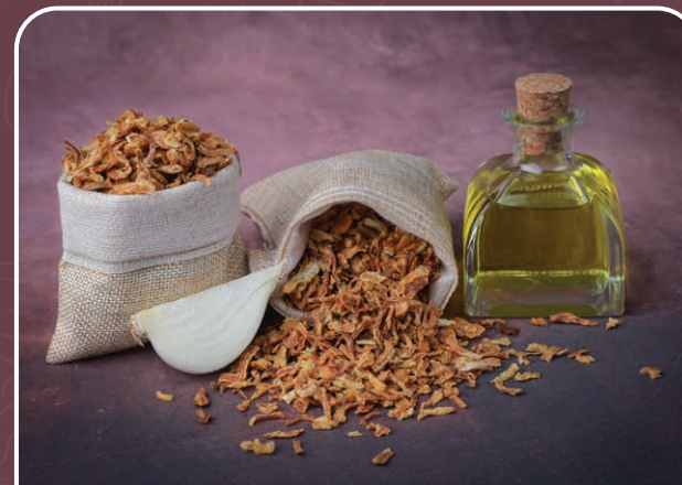
Fried Coated White Onion