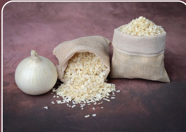
White Onion Chopped 3-5 mm