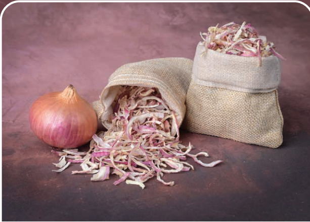
Pink Onion Flakes