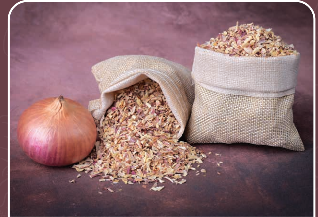
Pink Onion Minced 1-3 mm