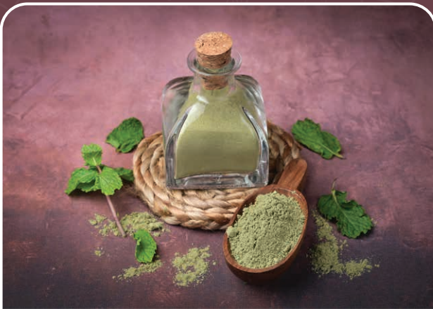
Mint Leaves Powder