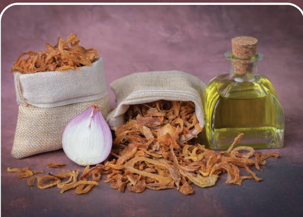
Fresh Fried Onion