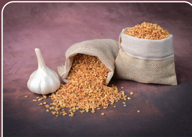
Garlic Chopped 3-5 mm