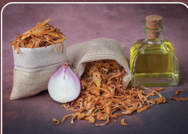
Fried Pink Onion Flakes