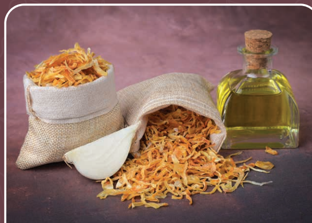
Fried White Onion Flakes