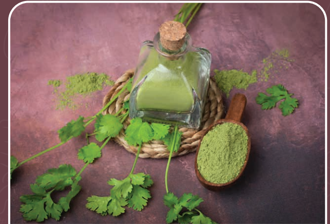
Coriander Leaves Powder