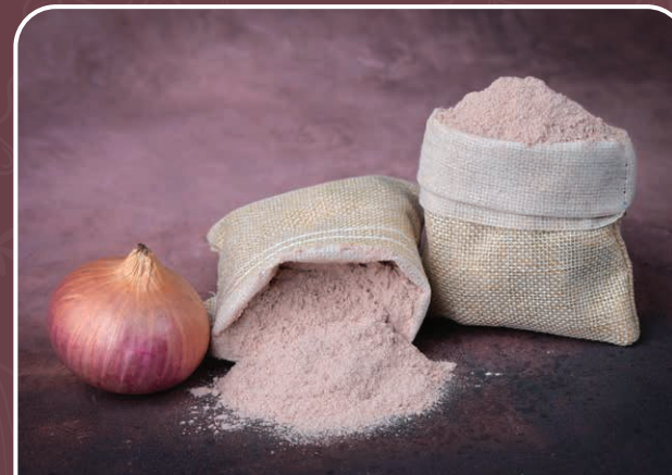
Pink Onion Powder