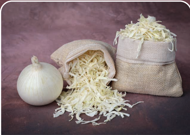
White Onion Flakes