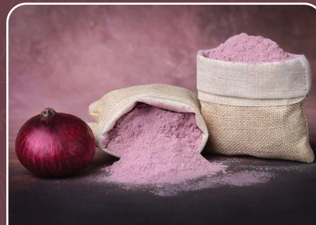
Red Onion Powder