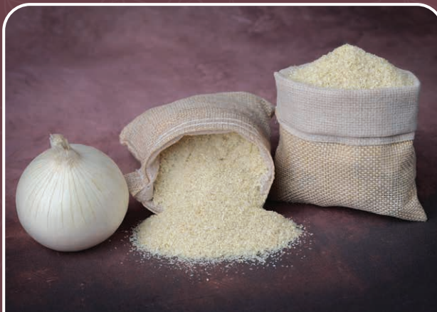
White Onion Granules 0.5-1 mm