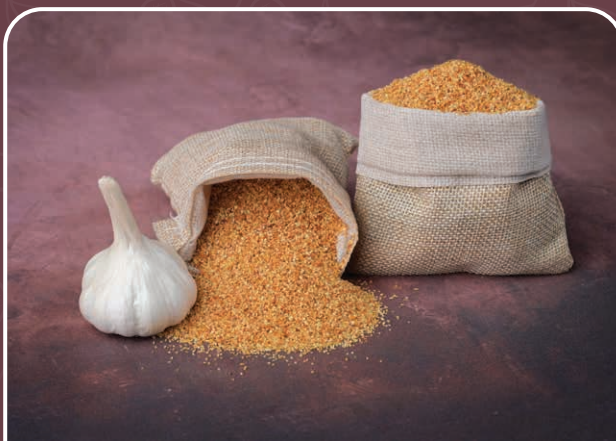
Garlic Granules 0.5-1 mm