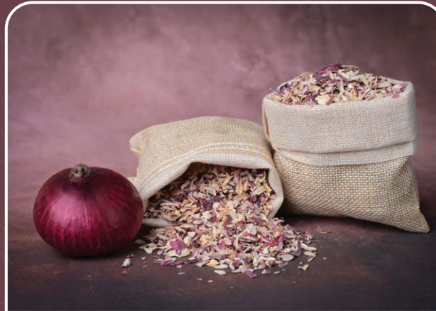
Red Onion Chopped 3-5 mm