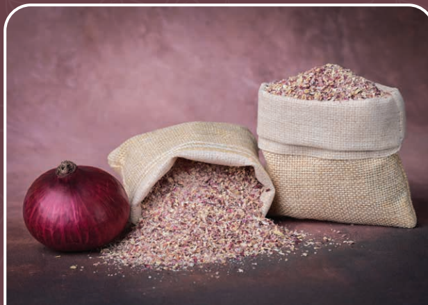
Red Onion Granules 0.5-1 mm