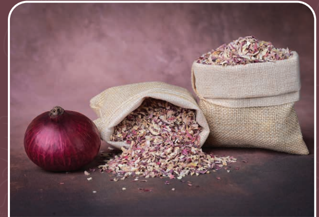
Red Onion Minced 1-3 mm