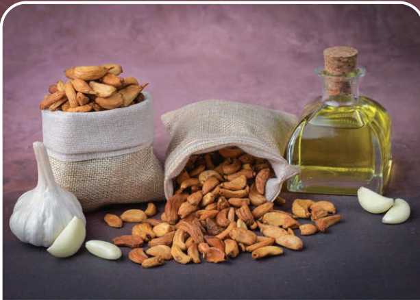
Fried Garlic Cloves