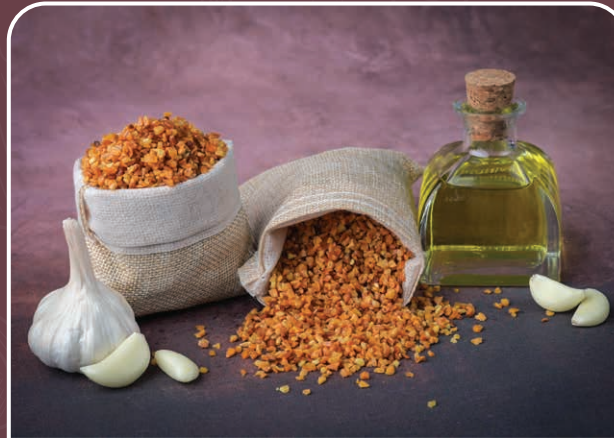
Fried Garlic Minced 1-3 mm