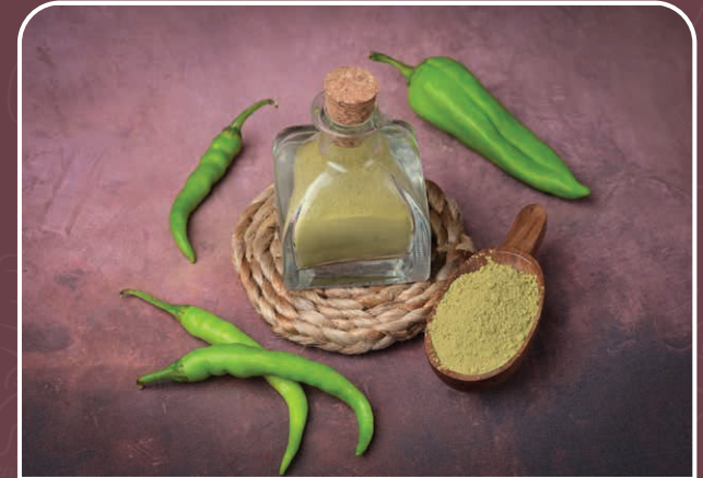
Green Chilli Powder