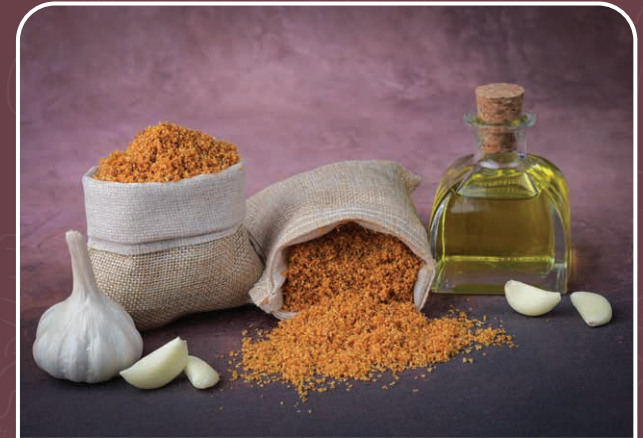
Fried Garlic Granules 0.5-1 mm