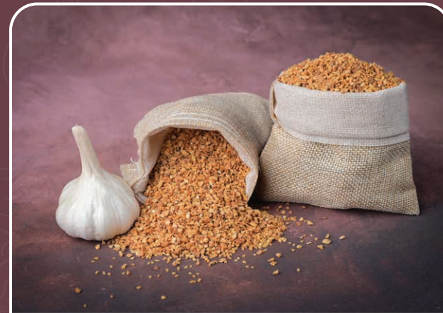
Garlic Minced 1-3 mm